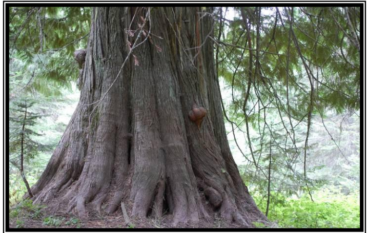
On August 28 the White Pine Chapter visited Moscow Mountain. The forest community is quite distinctive, supporting old growth western red cedar ( Thuja plicata ), pictured here, and an array of trees and understory plants more typical of higher elevation forests.