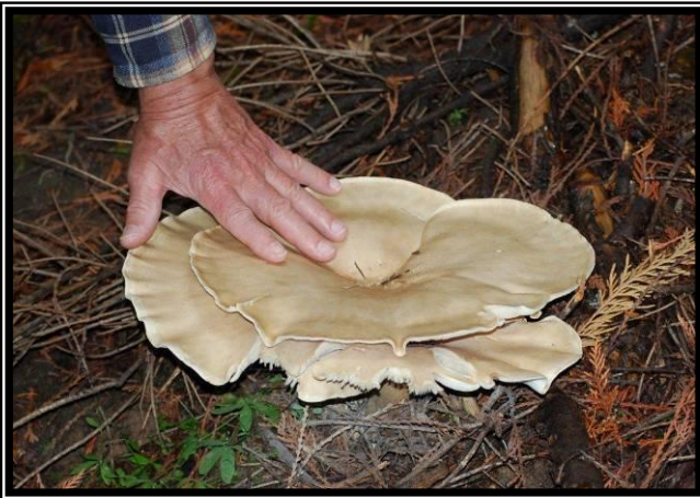
Conditions in North Idaho have been fantastic for fungi diversity and abundance this fall. Hopefully all were able to view, photograph and maybe even partake of some beautiful specimens. Photo by Nancy Miller taken on Moscow Mountain.