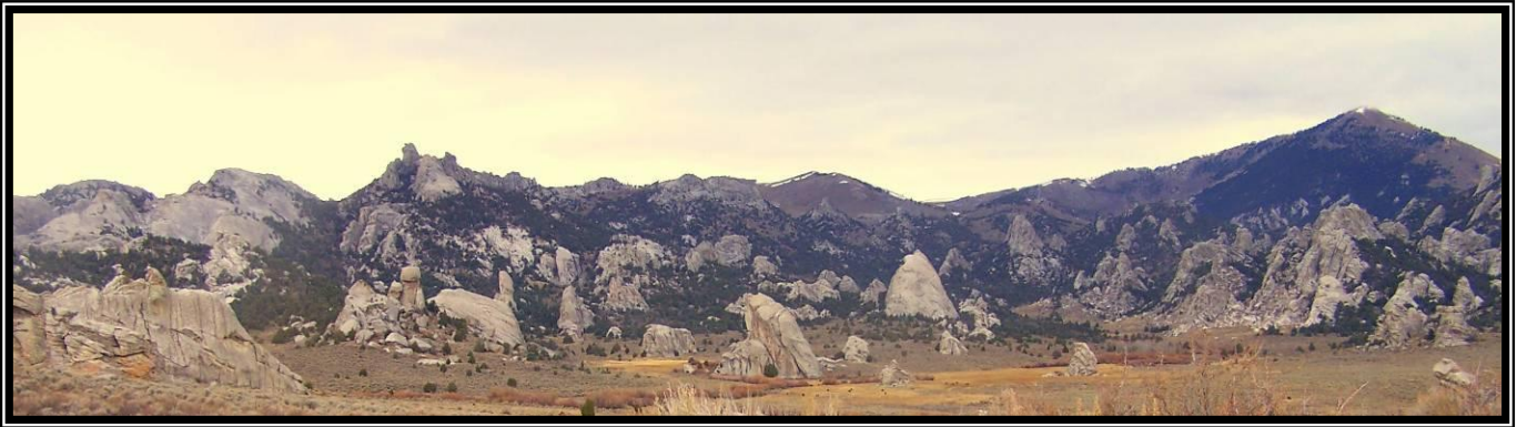
View of the Idaho City of Rocks from the south. Come explore this amazing place and share in a fun filled weekend at the Idaho Native Plant Society Annual Meeting, June 24-26, 2011.