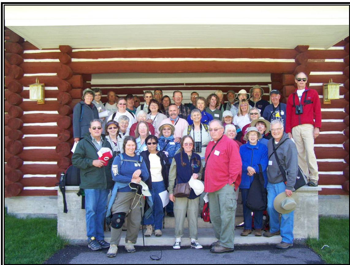
The Mesa Falls group on the porch of the Visitor's Center