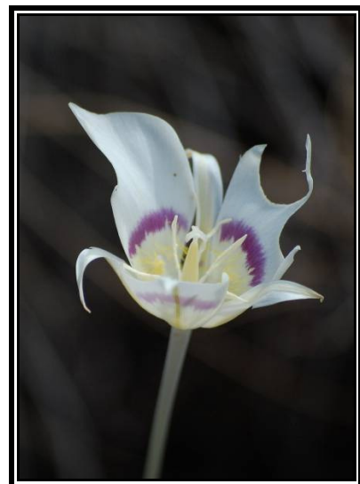
Calochortus macrocarpus var. maculosus

White Pine members enjoyed a field trip on June 20 th to the Mary McCroskey State Park , about 30 miles north of Moscow. We first identified trees, shrubs and forbs in the forested sections, with giant hemlocks being the tree of note. There was quite a variety of forbs blooming in addition to a number of invasive plants to identify. We were especially surprised at the number of seed pods of Fritillaria meleagris (checkered lily) which we found in several areas of the park, as well as the many colors of Penstemon attenuatus (purple, blue, pink, white) and the many shades of blue and purple of the native delphinium. We paused for a picnic at the park shelter area and then proceeded to the drier, western portion of the park along Skyline Drive, where we enjoyed seeing many blooming plants, especially the white version of the gilia ( Ipomopsis aggregata ) and the little sunflowers ( Helianthella uniflora ). A species list is posted on our website www.whitepineinps.org and will be updated with plants identified on this trip.