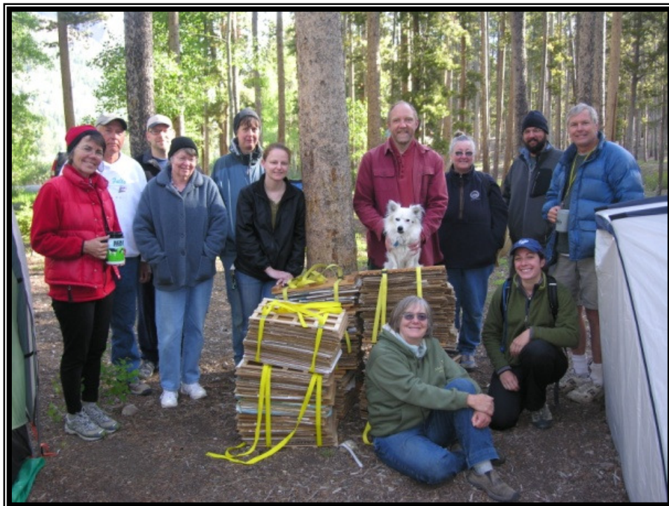
Foray participants smile at the fruits (& flowers) of their labor – a pile of full plant presses.

On Friday, Saturday, and Sunday we split into groups with each group collecting in a different area. One group gathered plants around the waterfalls of Fall Creek, another group collected in Chilly Slough and one brave group climbed part way up Mt. Borah to gather specimens. There were collections in many other areas as well. As a side note, the bitterroot were in full bloom at the time.