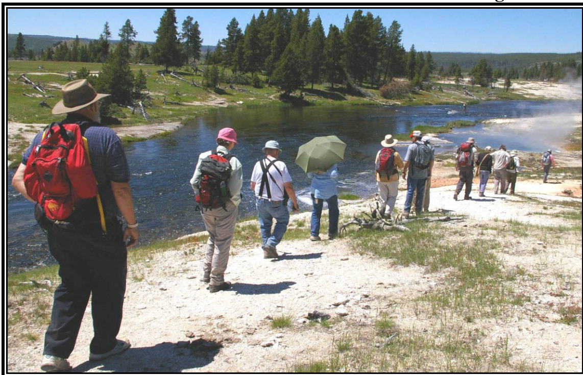
Hiking along the Firehole River in Yellowstone National Park