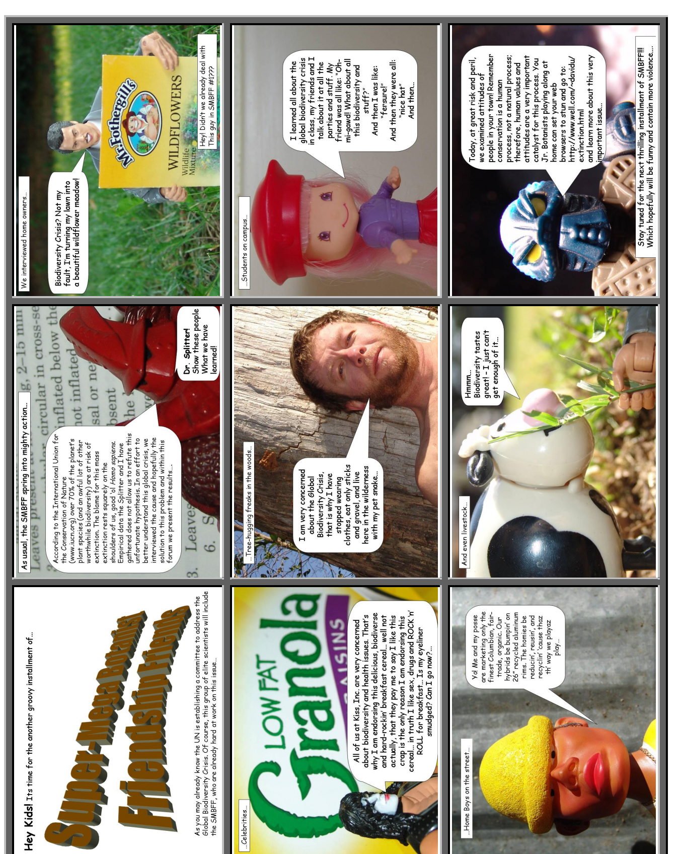
By Kent Fothergill