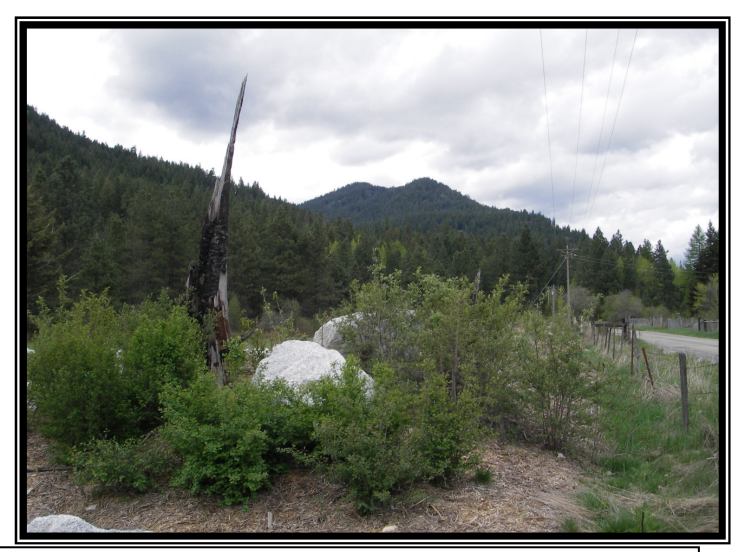
Before and after construction and planting of a parking lot. Photos part of Kinnikinnick Chapter's November 2007 program.