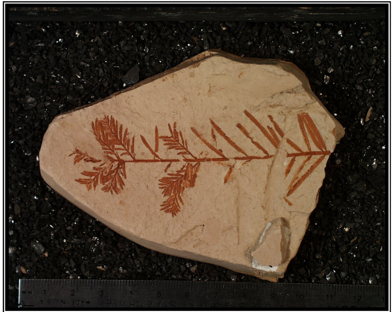
Fossil of Taxodium from the Miocene Clarkia Fossil site.