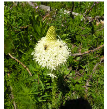
Xerophyllum tenax.