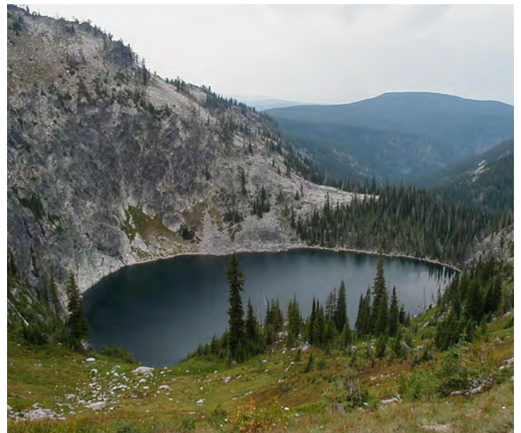
White Pine Chapter members hiked to Upper Gospel Lake, Gospel Hump Wilderness in July.