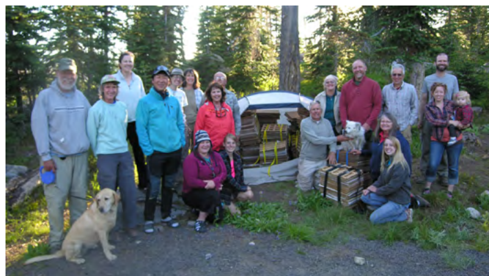
The 2013 Idaho Botanical Foray group photo at Hazard Lake campground on Saturday, July 13, 2013.