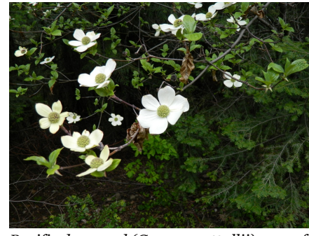
Pacific dogwood (Cornus nuttallii), one of many coastal disjuncts in the Clearwater refugia.

8 miles from Grangeville. At this time we anticipate two primary field trips, each will be offered twice. The first to areas near the confluence of the Lochsa, Selway, and Clearwater Rivers will