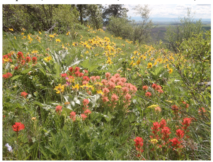
Palouse Prairie remnant on Paradise Ridge south of Moscow, Idaho.

The Palouse Prairie is a bunchgrass grassland located in northern Idaho and southeastern Washington. Less than 1% of the Palouse Prairie plant community remains, making it one of the most endangered ecosystems on the planet. Although the majority of the Palouse Prairie has been converted to agriculture, there are pockets that showcase the plants that historically blanketed this rolling landscape. These prairie remnants are located primarily on private land in areas that were too steep or too rocky to farm. The dominant native grasses on the Palouse are bluebunch wheatgrass ( Pseudoroegneria spicata ) and Idaho fescue ( Festuca idahoensis )