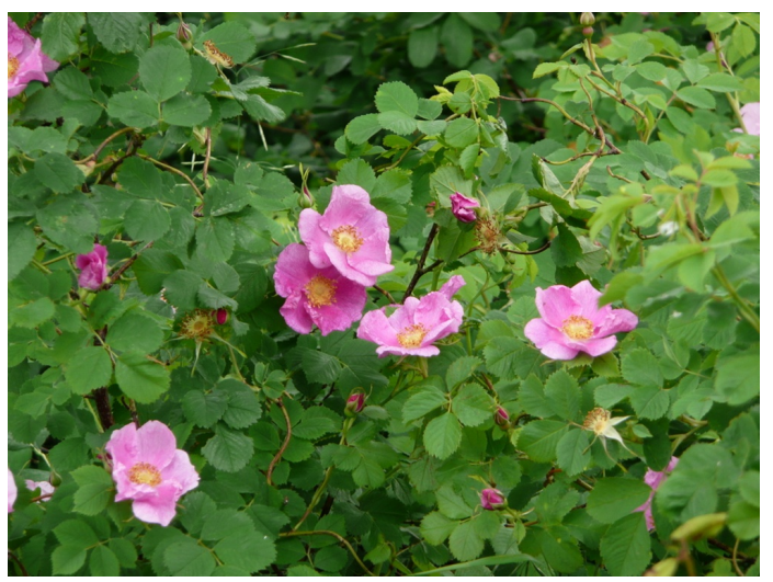
Nootka rose.