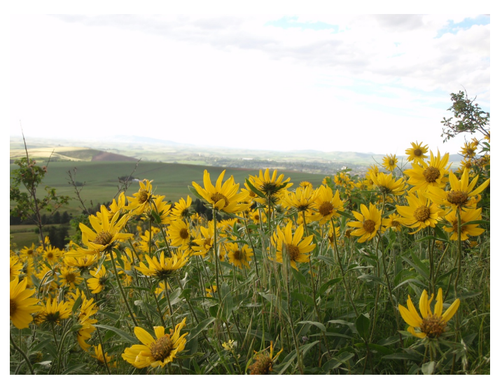
Little sunflower.

Early Detection and Rapid Response (EDRR) is an approach to weed control that aims to eliminate weed invasions before they are past the point of eradication. Containment is sometimes a more realistic strategy for larger invasions of species that are already prevalent across the landscape. In these cases, landowners focus on preventing the spread of invasive plants while attempting to shrink borders