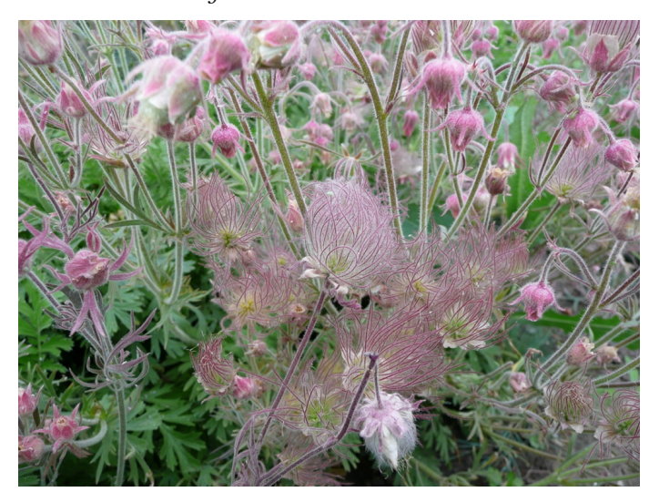
Prairie smoke.

and keep them contained in their current location. This is a systematic and time-consuming approach, but the effort is worthwhile if widespread invasions are reduced. We are fortunate to have weed researchers at both the University of Idaho and