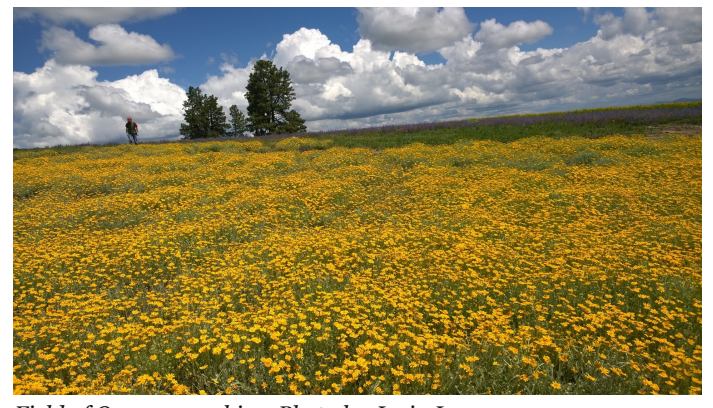
Field of Oregon sunshine.

With the knowledge of Palouse Prairie Foundation (PPF) members (a special thanks to Dave Skinner and Trish Heekin), we began with 10 perennial wildflowers in our seed-increase plot. The original source of our first wildflower seeding was wild-collected seed from Palouse Prairie remnants. These seeds were then planted into a one acre seed-increase plot with each species planted in multiple rows. Seed harvested from the rows was either sold or seeded into a field. Mark Mustoe, Clearwater Seed, assisted us with establishing our first Certified Cultivar Class native grass fields. Today we have 590 certified acres of 12 native grass varieties within six grass species, and 38 certified acres of seven native wildflowers species including little sunflower (Helianthella uniflora), Lewis flax (Linum lewisii), silky lupine (Lupinus sericeus), Oregon sunshine (Eriophyllum lanatum), taperleaf penstemon (Penstemon attenuatus), blanketflower