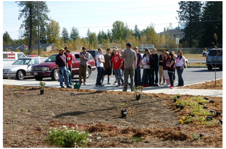
Planting day at Panhandle Animal Shelter.

Chapter of the Idaho Native Plant Society, stepped up to work on a solution - developing a plan, researching planting options, and helping to secure grant money and volunteers. The plan was to create a native plant landscape that would be more inviting and offer the public an opportunity to learn about our local native plants. As part of the fundraising effort, PAS applied for, and