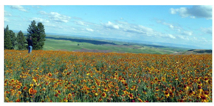
Wayne Jensen in field of blanketflower.

pounds. For an example, a blanketflower lab test reported 95% purity and 68% germination rate, calculating to a 62.56% Pure Live Seed. Germination can be