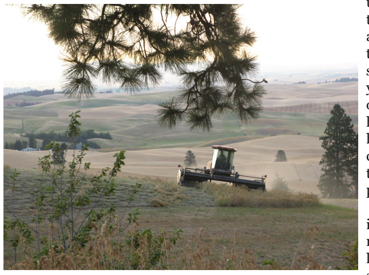
Swather cutting western yarrow into windrows. species. Rows of prairie

Native seed production complements our philosophy in farming with a focus on stewardship of the land as we strive to find that sweet spot between the