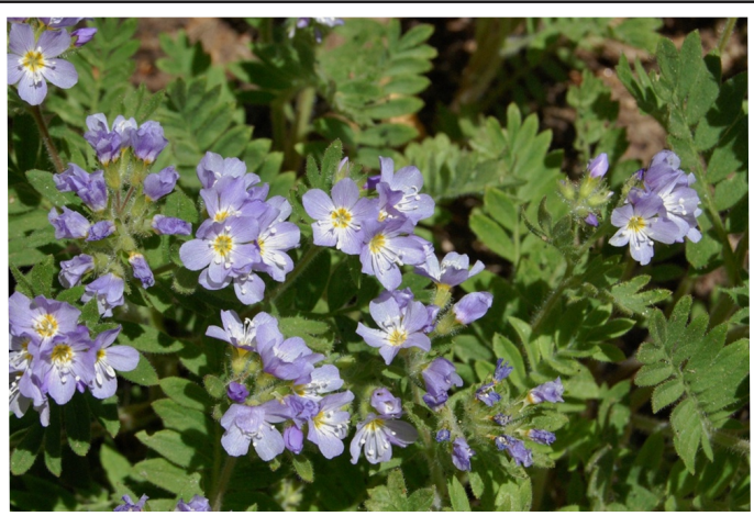
to share? Send it in to the editor: sage-editor [at] idahonativeplants.org.

The Idaho Mystery Plant in the June 2015 issue was Old Man of the Mountain, also sometimes referred to as graylocks four-nerved daisy ( Hymenoxys grandiflora ; synonym = Tetraneuris grandiflora ) in the aster family. It occurs in upper supalpine and alpine meadows. Its distribution includes mountain ranges in east-central Idaho, Montana, Wyoming, Utah, and Colorado. Have an Idaho Mystery Plant