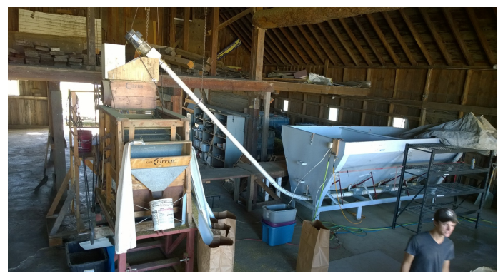
Seed cleaning equipment.

Thorn Creek Native Seed Farm provides tours of our operation and of Palouse prairie remnants on the property. Both provide great opportunities to educate the public about native plants and pollinators! If I am not available for a tour, people are welcome to walk