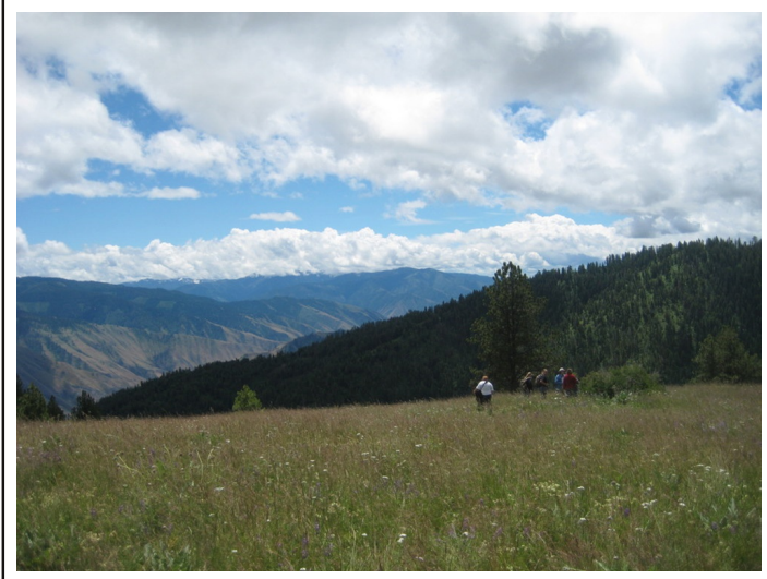
Mud Springs Ridge.

INPS White Pine chapter is hosting the 2016 INPS Annual Meeting near Grangeville, Idaho. Please mark your calendar and plan to join us. The proposed dates are Friday, June 10 through Sunday, June 12, 2016. There will be an optional event on Monday, June 13 for those who wish to stay to see more of this historic and flora-diverse area. The proposed camping location is the Fish Creek Group Camp and the Fish Creek Pavilion approximately