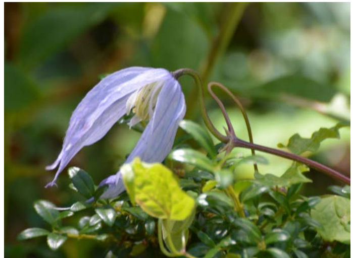
Western clematis.

Crossing a small stream gave many of us our first look at brook or stream saxifrage ( Saxifraga odontoloma ) with round, toothed leaves and its roots at water's edge. Unfortunately it was not blooming at this time. From here the trail got a little steeper with