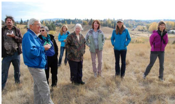
White Pine Chapter meeting PCEI tour.

Nursery, we were delighted by the blazing star ( Mentzelia laevicaulis ) that grew from a load of sand brought in. A broad stand of Wood's rose ( Rosa woodsii ) lined the entry, giving reassurance that invasive exotics haven't completely taken over the Palouse! The trip was not complete without a visit to the restroom—featuring composting, solar lighting, and rainwater hand-washing.