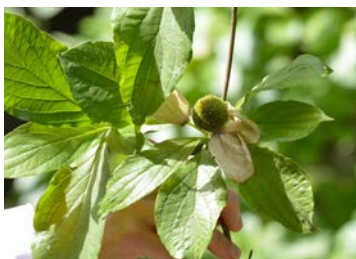
The Selway River corridor boasts inland populations of the mesic forest disjunct, Cornus nuttallii (Pacific dogwood) shown here a bit past peak flowering.

board, newspaper, and collecting supplies. With relatively easy road access to a variety of habitats, including the disjunct inland portions of the Pacific Northwest rainforests, mountain parklands, old growth Pacific yew, xeric grasslands, wetlands, and basalt scabs. The O'Hara Bar Campground on the Selway River just outside of Kooskia, Idaho provided a beautiful basecamp for our expeditions. We worked closely with Mike Hays, the botanist on the Nez Perce-Clearwater National Forest, to identify collecting localities to maximize botanical diversity and to offer participants an adventure suited to their liking (hiking vs.