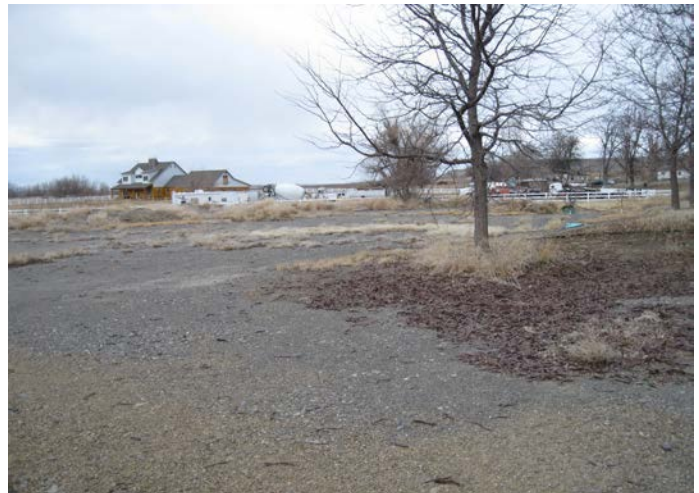
Bruneau schoolyard before planting.