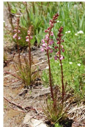
An uncommon pink form of Pedicularis contorta (coiled-beak lousewort) on Coolwater Ridge.