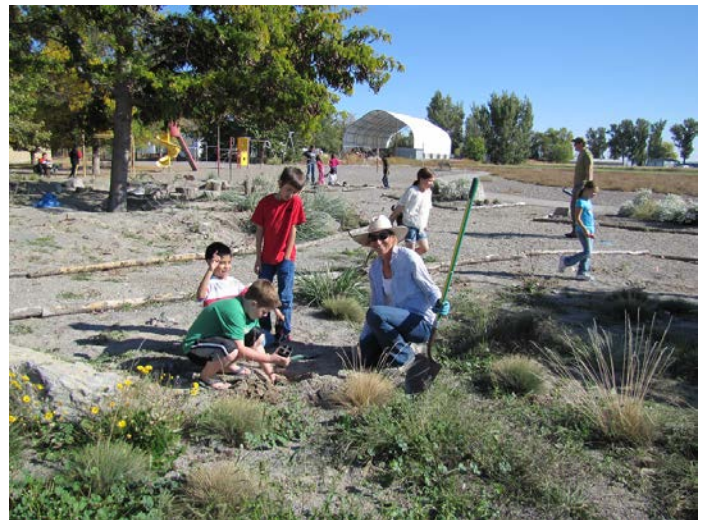
Weeding day in the wilderness garden.