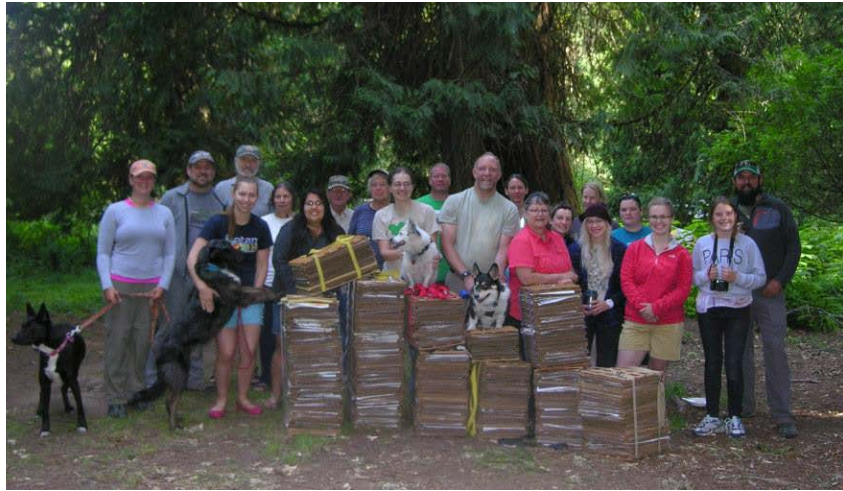
Group photo on Sunday morning with a pile of full presses.

From June 18 through the 22, 25 botanists, students, and other botanical enthusiasts from across the state descended upon the Selway River in the Nez Perce-Clearwater National Forest, marking the 8th annual Idaho Botanical Foray. Initiated in 2008