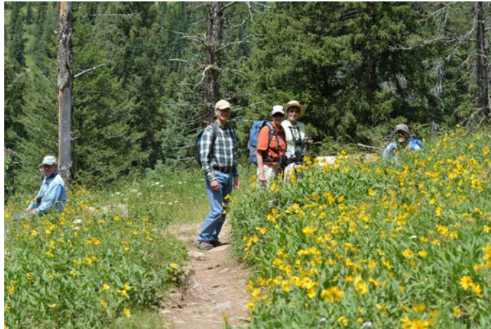
Darby Canyon field trips participants.