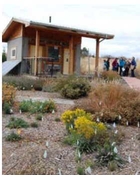
The restroom at PCEI.

Nursery, we were delighted by the blazing star ( Mentzelia laevicaulis ) that grew from a load of sand brought in. A broad stand of Wood's rose ( Rosa woodsii ) lined the entry, giving reassurance that invasive exotics haven't completely taken over the Palouse! The trip was not complete without a visit to the restroom—featuring composting, solar lighting, and rainwater hand-washing.