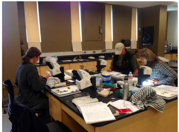
Aquatic plant identification during the workshop's classroom session.

Not only did Dr. Ertter provide a vast number of different genera with fresh material, she also took advantage of the impressive herbarium and enlightened the students with many herbarium specimens of aquatic species. Plants were presented in nice groups of shared characteristics, not necessarily by those most closely related. The day began with tiny floating plants where students from as far as Pendleton, Oregon and southeastern Idaho studied and differentiated between Spirodela , Landoltia , Lemna , Wolffiella , Wolffia , and Azolla . Next Dr. Ertter discussed submerged plants with divided leaflets, including, but not limited to Ceratophyllum , Utricularia , Myriophyllum , and Ranunculus aquatilis , and even pointed out a look-a-like algae, Chara . The class looked at the dreaded invasive, Eurasian watermilfoil ( Myriophyllum spicatum ), and learned a few key characteristics to help differ-