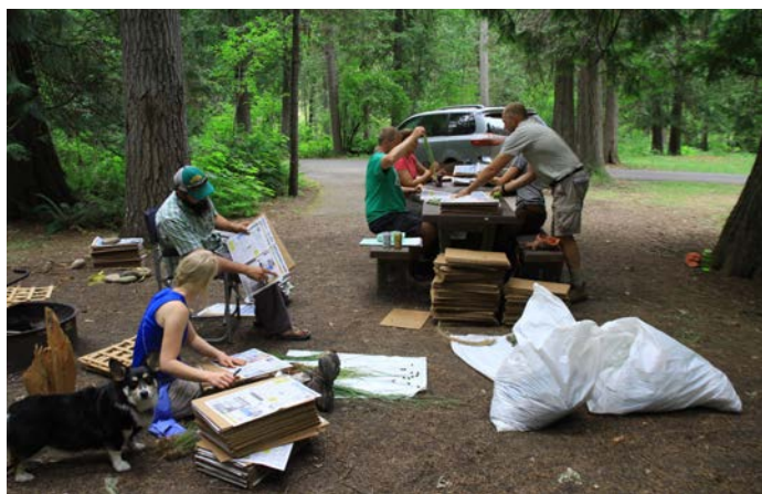
Processing plants back at camp after a long day of collecting.

board, newspaper, and collecting supplies. With relatively easy road access to a variety of habitats, including the disjunct inland portions of the Pacific Northwest rainforests, mountain parklands, old growth Pacific yew, xeric grasslands, wetlands, and basalt scabs. The O'Hara Bar Campground on the Selway River just outside of Kooskia, Idaho provided a beautiful basecamp for our expeditions. We worked closely with Mike Hays, the botanist on the Nez Perce-Clearwater National Forest, to identify collecting localities to maximize botanical diversity and to offer participants an adventure suited to their liking (hiking vs.