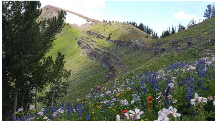
Taylor Mountain wildflowers.

optimism paid off however, as the rain stopped soon afterwards, and slowly, but surely the clouds began to lift. A blue sky overtook the clouds by the time we reached the base of Taylor Mountain a couple of hours later, and prevailed the rest of the day. The lower part of the hike took us through conifer forest, aspen, and subalpine meadow habitats. A few of the wildflowers along the way included sticky geranium ( Geranium viscosissimum ), arrowleaf balsamroot ( Balsamorhiza sagittata ), and Wyoming paintbrush