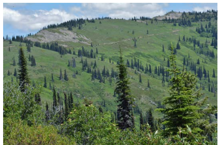
Views of the subalpine meadows along Coolwater Ridge above the Selway River.