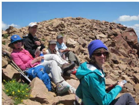
Lunch atop Taylor Mountain.