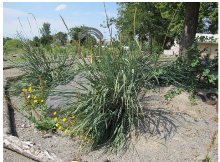
Basin wildrye, sundance daisy, and penstemons flank the amphitheater. Overshot gate with custom metal work in background.