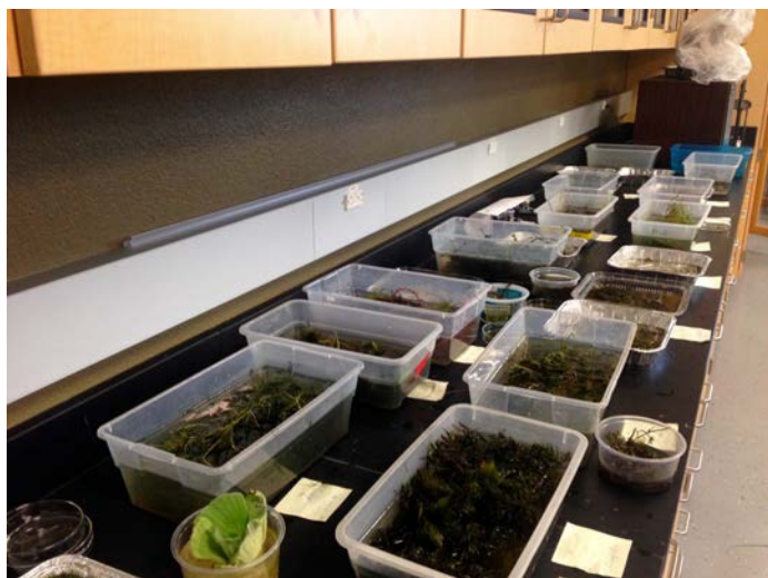
Trays of aquatic plants for the workshop's classroom session.

Armed with the full day of hands-on classroom time, the group met for a beautiful day at Marianne Williams Park in east Boise. During this field trip, participants identified plants and solidified their new knowledge. The group encountered several small wet depressions in the middle of the mowed lawn of the park, adjacent to a new apartment development within the floodplain of the Boise River. Several interesting species occurred in the depressions, including flowering Bacopa rotundifolia and