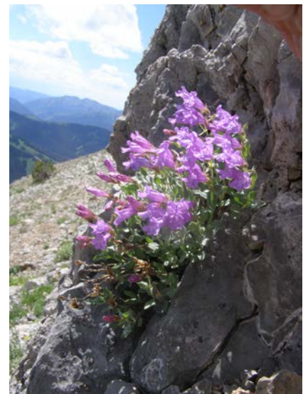
Mountain beardtongue.

phlox ( Phlox multiflora ), elkweed ( Frasera speciosa ), mountain beardtongue ( Penstemon montanus ), cutleaf daisy ( Erigeron compositus ), mountain townsendia ( Townsendia montana ), sulfur buckwheat ( Eriogonum umbellatum ), featherleaf kittentails ( Synthyris pinnatifida ), spiny milkvetch ( Astragalus kentrophyta ), and Schultz's milkvetch ( Astragalus schultziorum ). A rocky nook out of the breeze made for a comfortable lunch and rest spot in the mountain sunshine. While on top, we spent a little time looking, but failed to find sweet-flowered rock jasmine ( Androsace chamaejasme ), a Forest Service sensitive plant species previously reported to occur at Taylor Mountain. Inevitably, it came time to begin our descent and the approximately four mile hike back to the trailhead. Lots of botany, seeing old friends and meeting new ones, and a grand day in the mountains makes a tough combination to beat. •