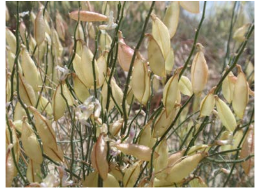
Packard's milkvetch pods.