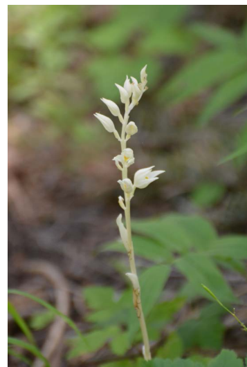
The mycoheterotrophic (parasite on mycorrhizal fungi) orchid, Cephalanthera austiniiae, in the understory of the mesic forests along the Selway River.