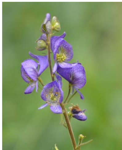
Monkshood.