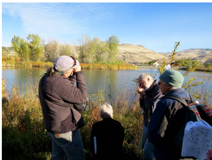
Plant identification during the field trip to Marianne Williams Park, Boise.

Potamogeton . The class ventured out of the deeper water into pond and stream edges and mud flat species including tiny grass-like plants of Eleocharis , Isoetes , Sagittaria , Subularia , Myosurus , and Triglochin . Larger grass-like plants included Juncus , Sparganium , Typha , Cyperus , Scirpus , and on to broad-leaved monocots and many other mud flat and wetland plants.