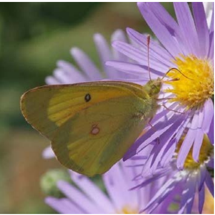
Orange Sulphur Butterfly

Jessica's aster is currently being grown in a number of ornamental and wild gardens in the Palouse area. Plants can become very robust if placed in a favorable location. When blooming in late August and September it is a magnet for various pollinator insects which use it as a food source. On a warm late summer day, multi-stemmed plants may have six to eight pollinator species present at once, often with several individuals of each species. The following photos provide a sampling of these insect visitors. •