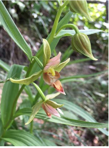
Epipactis gigantea.

higher elevation (6000 feet) with great wildflowers and views. It was a trip that almost didn't happen. The week before the field trip an announcement said the access road would be closed to vehicles because of logging activities related to a 2014 wildfire. Negotiations ensued – we got a key to the locked gate. Our thanks to Nan Vance for helping resolve this