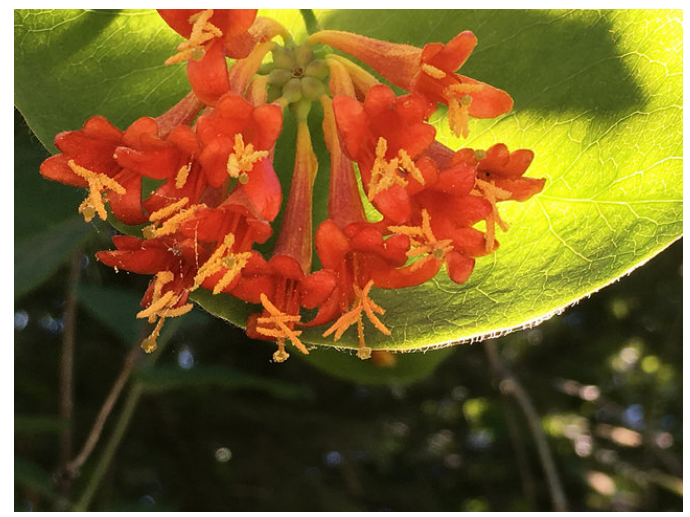
Lonicera ciliosa.

The sun dried the thick foliage of Canyon Creek. The history, rushing creek, and promise of lush vegetation had us enthralled, from expert photographers to hiking