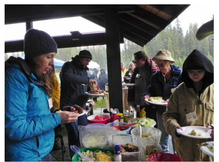
Plenty of good food to choose from during the Saturday evening dinner.

rainfall. We were grateful for the pavilion at the main campground and for the canopies which were provided and set up by chapter volunteers. Various small groups headed off to botanize trails near the campgrounds after registering. We all came together in the evening for a chapter-hosted barbecue and potluck. Reid Miller brought a grill and did the honors of grilling sausages and veggie burgers for the group. Lots of very tasty salads and desserts were provided by all of the attendees. Down vests and jackets and warm hats were very much in evidence at dinner. Dry tents and trailers and warm sleeping bags were sought out early after dinner, although a few campfires captivated and warmed folks for a while. There was even a little gloating by those who had made reservations to stay in Grangeville motels. Several attendees had stories of encounters with large animals on their way to