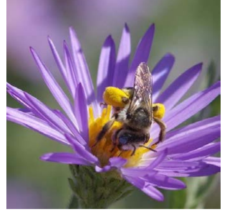
Bee loading pollen Sage Notes Vol. 38 (3) September 2016