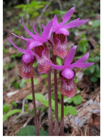
Fairy slipper (Calypso bulbosa).

fairy slipper phantom orchid summer coralroot Pacific coralroot hooded coralroot vellow coralroot spring coralroot clustered lady's slipper mountain lady's slipper lesser yellow lady's slipper stream orchid western rattlesnake plantain northern twayblade northwestern twayblade broadlipped twayblade heartleaf twayblade scentbottle elegant piperia denseflower rein orchid Alaska rein orchid northern green orchid Huron green orchid bluntleaved orchid lesser roundleaved orchid slender bog orchid Ute ladies-tresses creamy ladies-tresses hooded ladies-tresses