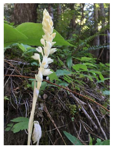
Cephanthera austinae.

way. Of course Constance's bittercress was on everyone's wish list. We also found phantom orchid (Cephanthera austinae) and clustered lady slipper (Cypripedium fasciculatum) along a road cut. Incredible stands of wild hollyhock (Iliamma rivularis) on both sides of the road impressed everyone—on one side incorporated into a view of the Selway River far below us, and