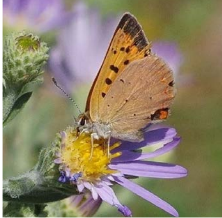
Purplish Copper Butterfly