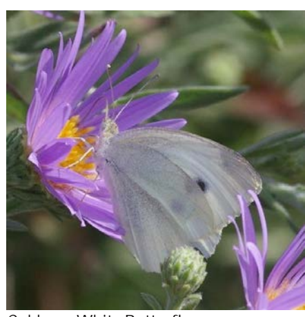
Cabbage White Butterfly