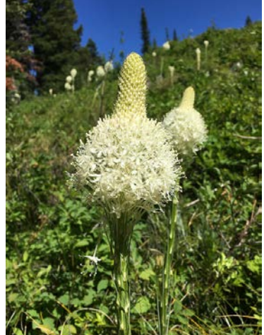
Xerophyllum tenax.

The day started out cloudy and cool, with most participants wearing every layer they brought with them. There were a few mutterings about perhaps being too early in the season—the snow had just melted off a few weeks before and there might not be much to see. But we found nu-