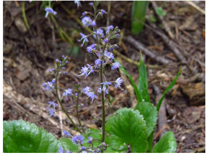
Synthyris platycarpa, Coolwater Ridge field trip.