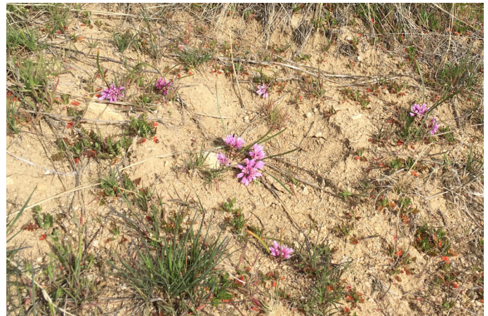
Newly transplanted Aase's onion in bloom.