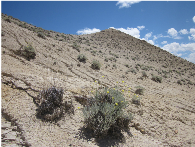
Eriogonum calcareum var. calcareum habitat in Payette County, Idaho.

our soil property measurements were well within the range that normally impose no stress to plant functions. It is possible selection forces are operating more slowly