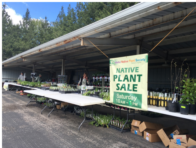
Ready for business at the 2017 Pahove Chapter Native Plant Sale.