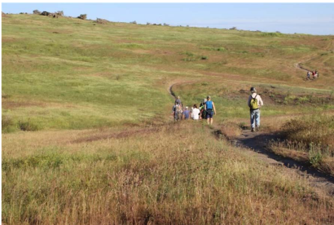
Pahove members on a tour of the post-fire Table Rock restoration area.