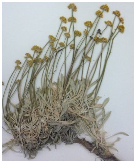
Eriogonum calcareum var. calcareum pressed specimen (from north of Snake River).

enced by the two populations. We do know that extreme mineral compositions can impose selection pressures on plant populations and drive significant adaptation. However, the levels of minerals in the outcrops we measured were not as extreme as environments where these adaptations have been demonstrated elsewhere. Many of