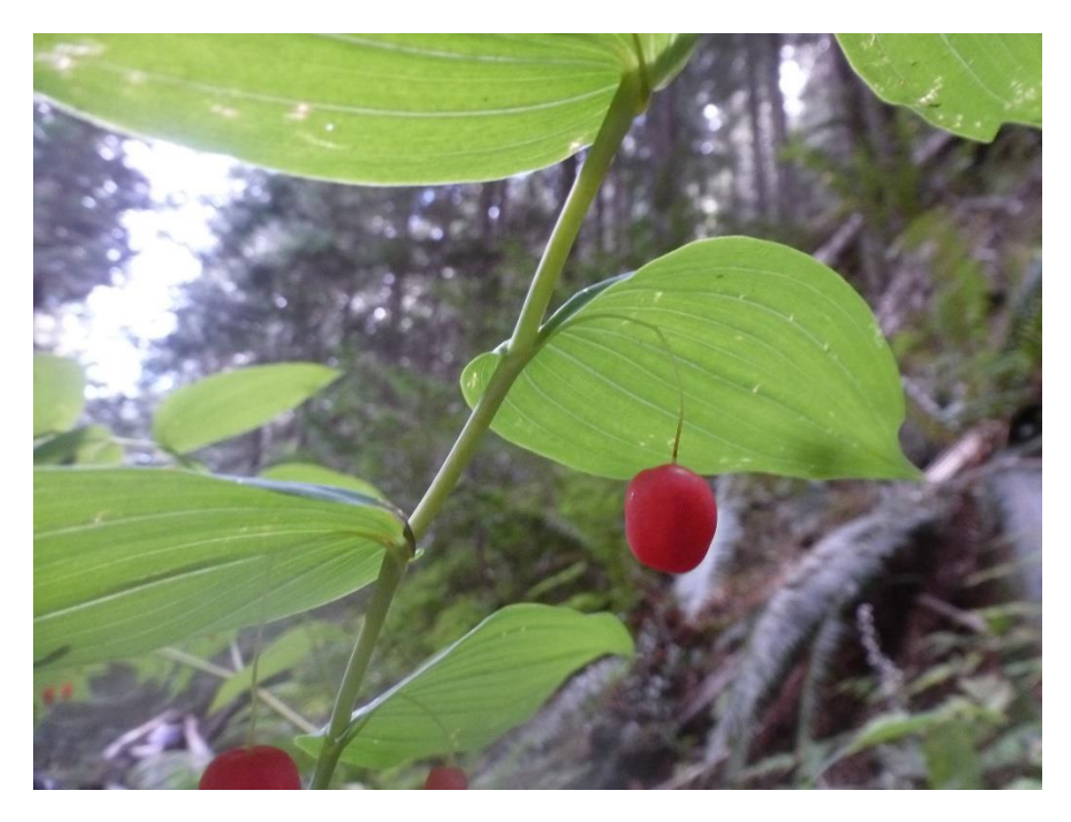
Twisted-stalk ( Streptopus amplexifolius ) - One of the many plants seen along the Coal Creek Trail

6:00 pm to 7:00 pm – Dinner meal. We will have our dinner meal catered by the Snake Pit Restaurant at the Bumblebee Campground Group Site. The Snake Pit has been in operation since the gold/silver rush days in 1880 and is famous in the area. The meal will consist of BBQ brisket, pulled pork, beans, salad, and lemonade. You are welcome to bring other beverages of your choice. A vegetarian meal of vegetable rice pilaf will be available on request. The cost of the meal is $16 per person. Purchase of the meal is optional. Your reservation needs to be received by June 15. Seating is limited so bring your camp chair for use during the meal.