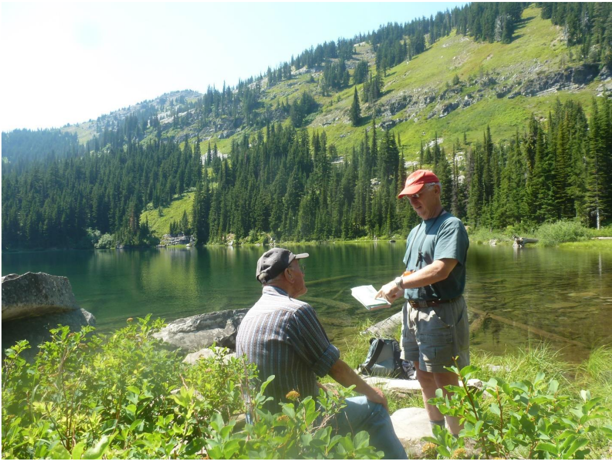
Calypso Chapter members at Revett Lake

9:00 am to 2:00 pm – Deception Creek Experimental Forest. The Deception Creek Experimental Forest is 19 miles from Bumblebee Campground. The forest was established in 1933 when large, old western white pines were important for producing lumber products. Research at the experimental forest focused on the ecology and silvicuture of western white pine. The 291-acre Montford Creek Research Natural Area is located within the forest. Many species of plants are to be found including the rare deer fern ( Blechnum spicant ).